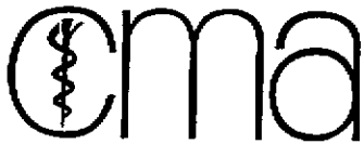
EXHIBIT Study L-4000 California Medical Association

221 Main Street, P.O. Box 7690, San Francisco, CA 94120-7690 (415) 541-0900 Physicians dedicated to the health of Californians